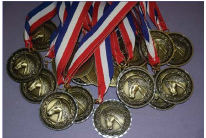
All team participants received medals for each sport completed.