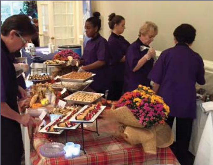
Students and Perkins food services staff prepare at last year's event – offering an assortment of cannoli.